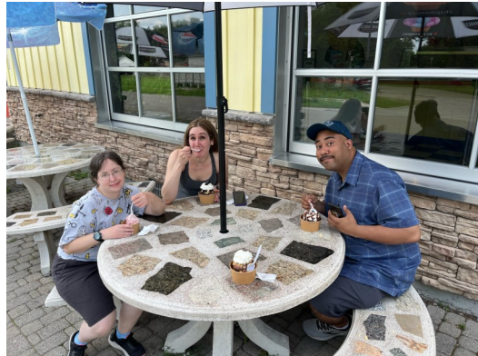
Young adults enjoying their ice-cream at the social in July.

Wednesday, June 12—Outing (more info later)